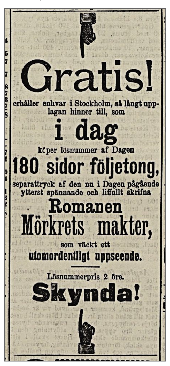
Left: Aftonbladet of Monday, 31 July 1899 Right: Dagens Nyheter of Friday, 4 August 1899

Similar advertisements appeared in Aftonbladet of 2 August 1899, in Dagens Nyheter of 1, 2, 3 and 4 August 1899, and in Svenska Dagbladet of 3 August 1899, the special offer always being valid for the same and/or subsequent days of the week. In Dagens Nyheter of 4 August, the size of the promised reprint has increased to 180 pages. The advertisement adressses buyers of single news paper copies of Dagen and offers "180 pages supplement as a separate print [separattryck] of the extremely thrilling and lively written novel Mörkrets makter , currently appearing in Dagen , that has raised extraordinary interest."